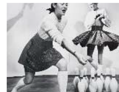
"Fashion Bowling," 1946 by Genevieve Naylor, typifies the frisky charm and originality in the work of female photographers in Weinstein Gallery's show.

Two women of Islamic heritage, Hend al-Mansour from Saudi Arabia and Leili Tajadod-Pritschet from Iran, collaborate on a "tribute and oblation to the sacred feminine in Islam." With language, images and